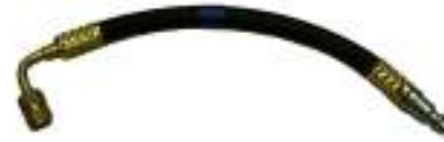
Part # 7054 GM 90° Schrader Valve