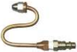
Part # 7050 Regular S-Hook Spray Nozzle that comes with FSE 130 Canister