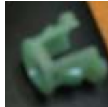
Part # 3102 Plastic Clips