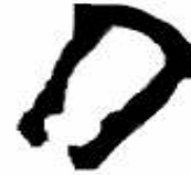
Part # 3222 Ford Fuel Line Retainer Clip 3/8 Replacement for UFQD38