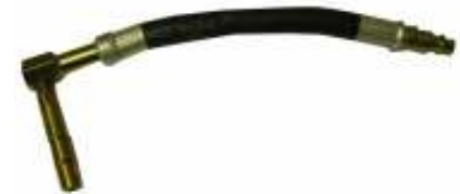
Part # FQD516 NEW