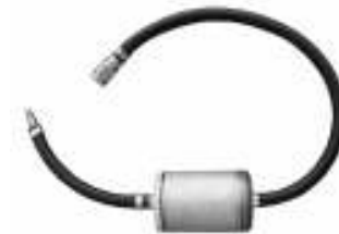
Part # ATS-FI ATS Fluid Injector for Cleaner or Conditioner Use on Sealed Transmissions CA Origin