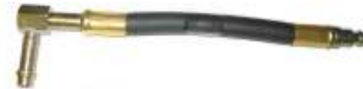
Part # GMA12 NEW Yukon GM 1/2 Male Push to Connect

The above fittings are all US origin unless otherwise noted.