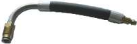
Part # DFM12 NEW Deep Flare Male 1/2 2003 + Ford

Hook up to bottom line on the temp valve on the transmission side. New fluid line toward transmission.