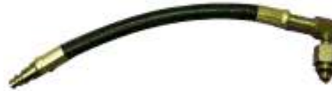
Part # FSM Ford/Saturn Male