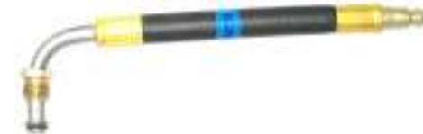
Part# GMM16 NEW Jeep