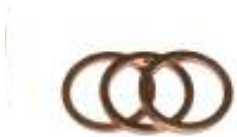
Part # IBW12 Washers (4)