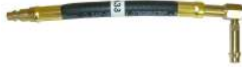
Part # GMA38 3/8" New Style GM Push to Connect