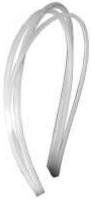
Part # 7061 1/4" Polyurethane Hose 60" long