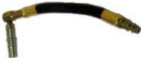
Part # FQD12 NEW Ford Quick Disconnect 1/2"