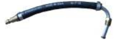
Part # FM3178 NEW Ford Male for an F150

Hook up to bottom line on the temp valve on the transmission side. New fluid line toward transmission.