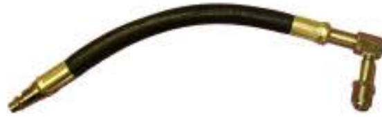
Part # CMM Chrysler male Metric