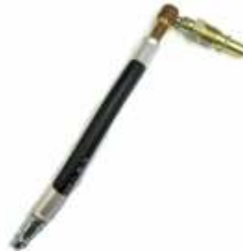
Part# JAG-M Jaguar/Land Rover adapter Male