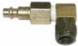
Part # 4208 GM 3/8 Female Quick Connect Use with GMA 3/8