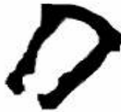
Part # 3222 Ford Fuel Line Retainer Clip 3/8 Replacement for UFQD38