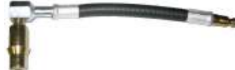
Part # GMA58 Male 5/8 Push to Connect GMC Duramax Hose