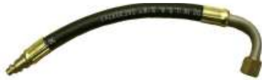
Part # CFM Chrysler Female Metric