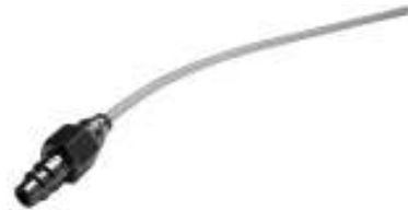
Part # 7064 1/4" Hose Adaptor