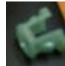
Part # 3102 Plastic Clips