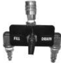
Part # 7068 Valve Adaptor

All fittings are Canadian origin unless otherwise noted