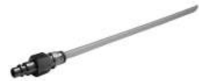
Part # 7066 3/8" Hose Adaptor