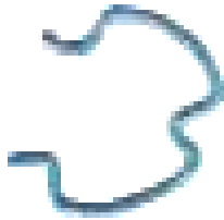
Part # 4246 3/8 retainer clip