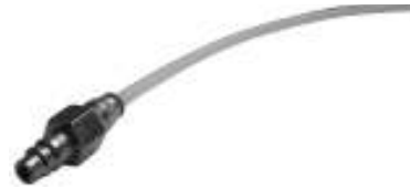
Part # 7065 5/16" Hose Adaptor