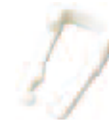
Part # 3318 1/2 Vent Connector