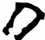
Part # 3222 Ford Fuel Line Retainer Clip 3/8 Replacement for UFQD38