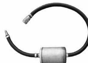
Part # ATS-FI ATS Fluid Injector for Cleaner or Conditioner Use on Sealed Transmissions