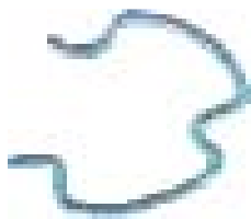
Part # 4247 1/2 retainer clip