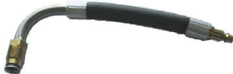
Part # DFM12 NEW Deep Flare Male 1/2 2003 + Ford