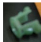
Part # 3102 Plastic Clips