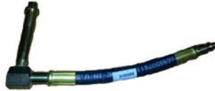
Part # BMWF10