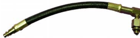
Part # FSM Ford/Saturn Male