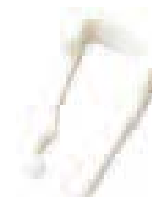
Part # 3318 1/2 Vent Connector