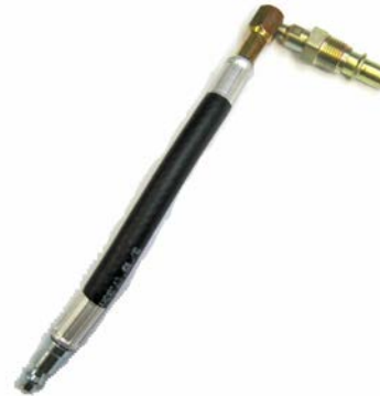
Part# JAG-M Jaguar/Land Rover adapter Male