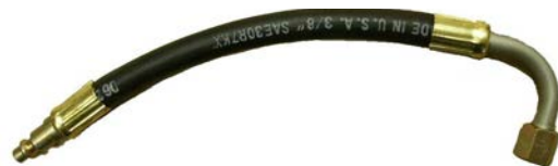
Part # CFM Chrysler Female Metric