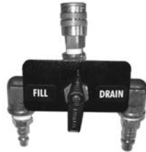
Part # 7068 Valve Adaptor

All fittings are Canadian origin unless otherwise noted