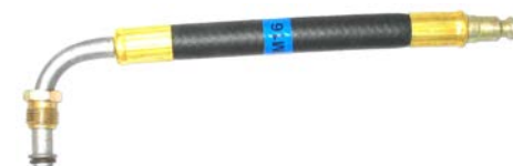
Part# GMM16 NEW Jeep