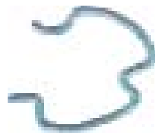
Part # 4248 5/8 truck retainer clip