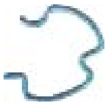
Part # 4246 3/8 retainer clip