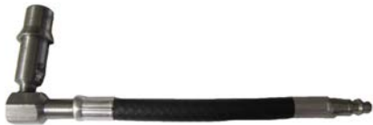
Part# GMA3/4 NEW Male 3/4 Push to Connect GMC Duramax Hose