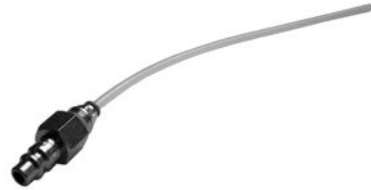
Part # 7064 1/4" Hose Adaptor