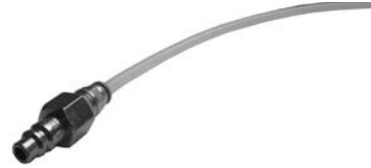
Part # 7065 5/16" Hose Adaptor