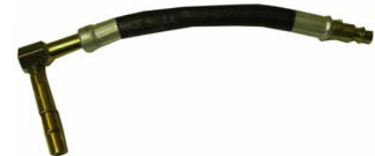
Part # FQD516 NEW CA Origin