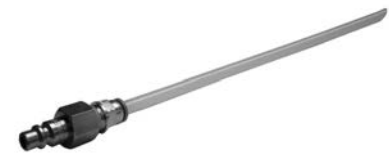
Part # 7066 3/8" Hose Adaptor