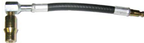
Part # GMA58 Male 5/8 Push to Connect GMC Duramax Hose