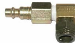
Part # 4208 GM 3/8 Female Quick Connect Use with GMA 3/8