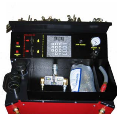
Part# F-0220 Organization Fitting Box that hangs off the back of ATS 320/330