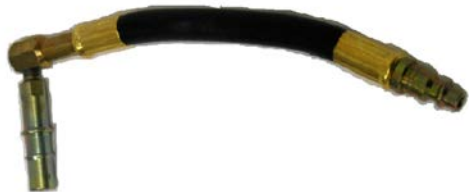
Part # FQD12 NEW Ford Quick Disconnect 1/2"