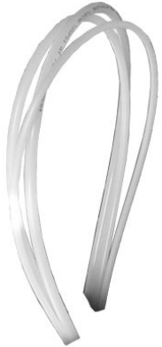
Part # 7061 1/4" Polyurethane Hose 60" long