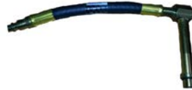
Part # BMW10