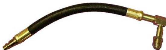
Part # CMM Chrysler male Metric