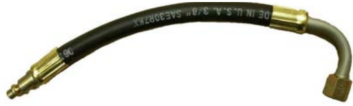
Part # CFM Chrysler Female Metric