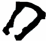
Part # 3222 Ford Fuel Line Retainer Clip 3/8 Replacement for UFQD38