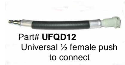
Part# UF12 Universal 1/2 female push to connect