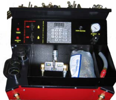
Part# F-0220 Organization Fitting Box that hangs off the back of ATS 320/330