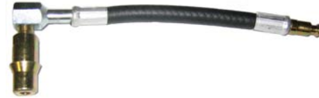
Part # GMA58 Male 5/8 Push to Connect GMC CA Origin