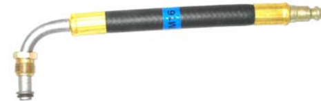
Part# GMM16 NEW Jeep