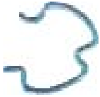
Part # 4246 3/8 retainer clip