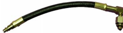
Part # FSM Ford/Saturn Male