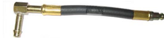
Part # GMA12 NEW Yukon GM 1/2 Male Push to Connect

CA Origin The above fittings are all US origin unless otherwise noted.