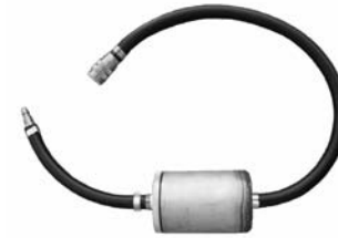
Part # ATS-FI ATS Fluid Injector for Cleaner or Conditioner Use on Sealed Transmissions