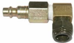
Part # 4208 GM 3/8 Female Quick Connect Use with GMA 3/8