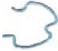
Part # 4247 1/2 retainer clip