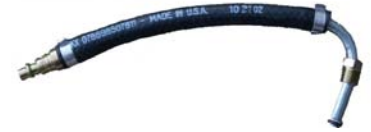
Part # FM3178 NEW Ford Male for an F150