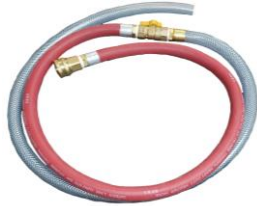
Part # DFS 910-53