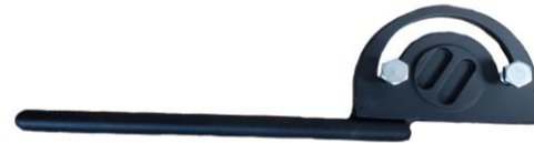
Part # DFS 910-51