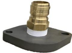
Part # DFS 910-22-1A