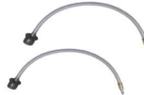
Qty. 2 Part # DFS 910-24-1 - 1 1/2"