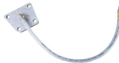
Part # DFS 910-27