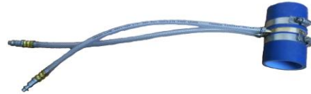
Part # DFS 910-44-1