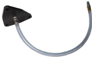
Part # DFS 910-50