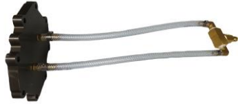
Part # DFS 910-42