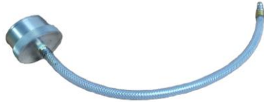
Part # DFS 910-M8-2