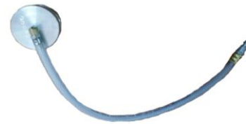
Part # DFS 910-M8-3