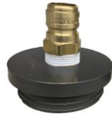
Part # DFS 910-19-4A