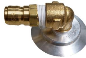
Part # DFS 910-46-2