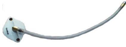
Qty.1 Part # DFS 910-22