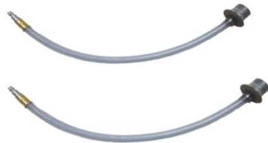
Qty. 2 Part # DFS 910-24-2 - 1 1/4"