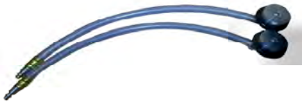
Part# DFS 910-41 Pacar (2)