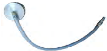
Part# DFS 910-M8-3 Volvo/Mac EGR Adapter