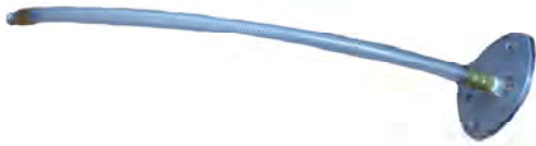
Part# DFS 910-32 Mac Volvo