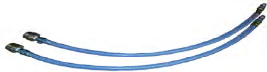
Part# DFS 910-45-1