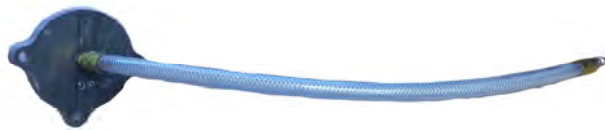
Part# DFS 910-28 Detroit DD13,15,16