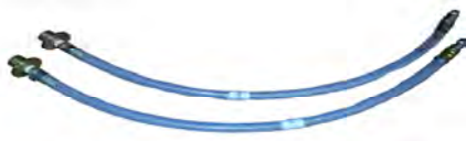
Part# DFS 910-45