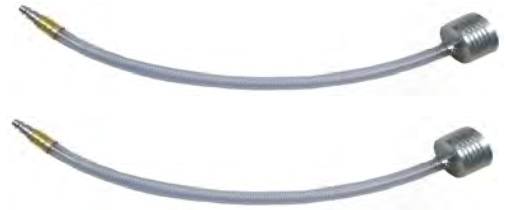
Part# DFS 910-24-3 Detroit Diesel Series - 2" Adapter (2) Pieces