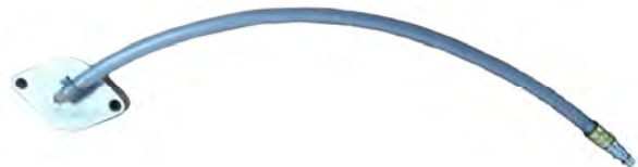
Part# DFS 910-36 Mercedes - Bus