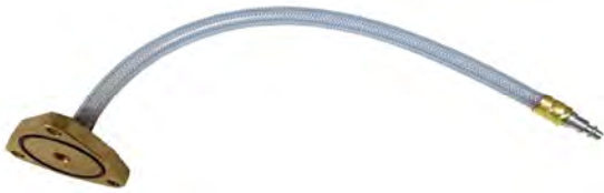
Part# DFS 910-37 International