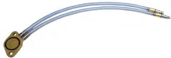
Part# DFS 910-48