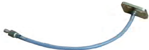
Part# DFS 910-34-1 Duramax Diesel 6.6L