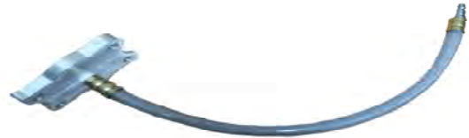
Part# DFS 910-40 Hino Adapter