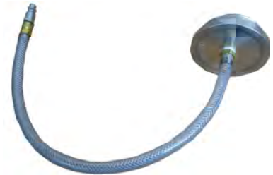
Part# DFS 910-19-2 Cummins ISX14 2007-2010 Adapter