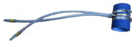
Part# DFS 910-44-1 Cummins Adapter 2"