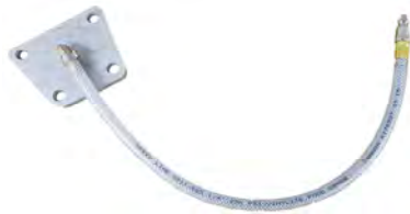
Part# DFS 910-27 Mercedes MBE 900