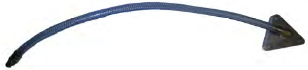
Part# DFS 910-38 International DDT Maxforce 7.6L (2)