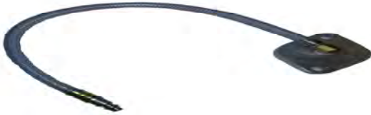
Part# DFS 910-39 Oval Fitting / Hino Adapter