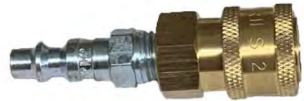
Part# DFS 910-52 DFS Multi Coupler