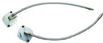
Part# DFS 910-22 Cummins ISX15 2011 and newer (2)