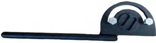
Part# DFS 910-51 Cummins EGR Opener