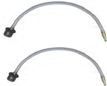
Part# DFS 910-24-1 Detroit Diesel Series 60 - 1 1/2" Adapter (2) Peices