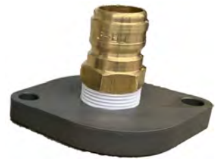
Part# DFS 910-22-1A Cummins ISX 15 EGR Cooler Flush Adapter