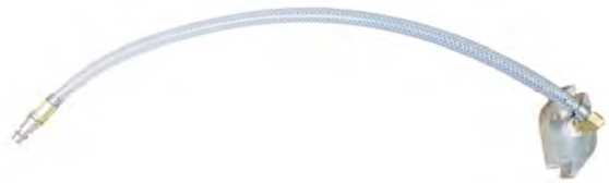
Part# DFS 910-27-2 Mercedes MBE 900