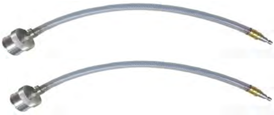
Part# DFS 910-24 Detroit Diesel Series 60 - 1 3/4" Adapter (2) Pieces