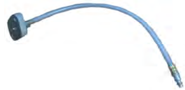
Part# DFS 910-31-1 Grand Cherokee Jeep and Eco Diesel Truck 1500