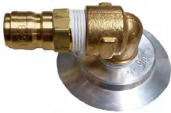
Part# DFS 910-46-2