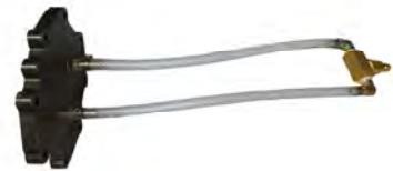
Part# DFS 910-42 Mercedes MBE 4000 2006 and newer