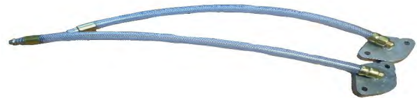
Part# DFS 910-18 Ford 6.7 Liter (2)