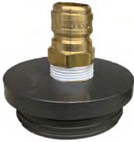
Part# DFS 910 19-4A Cummins ISX 14 EGR Valve Adapter