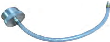
Part# DFS 910-M8-2 Volvo/Mac EGR Adapter