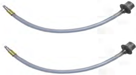
Part# DFS 910-24-2 Detroit Diesel Series - 1 1/4" Adapter (2) Pieces