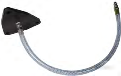
Part# DFS 910-50