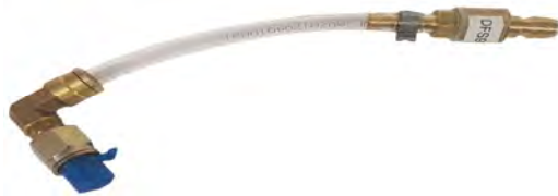
Part# DFS 910-25 Jeep Fitting