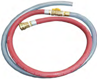
Part# DFS 910-53 EGR Cooler Hose