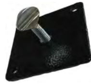
Part# DFS 910-9 EGR Manual Opener