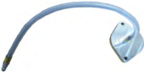
Part# DFS 910-19 Cummins ISX14 2007-2010 Adapter