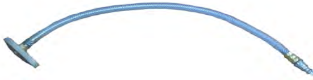
Part# DFS 910-31 Grand Cherokee Jeep and Eco Diesel Truck 1500