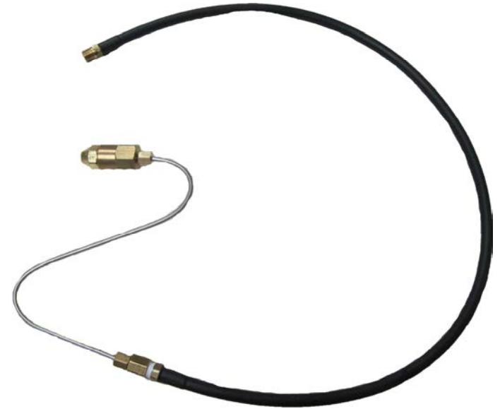
Part# 6117 Black Hydraulic Hose Assembled - 3 FT