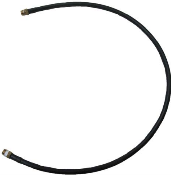
Part# 6118 Black Hydraulic Hose Assembled – 2.5 FT