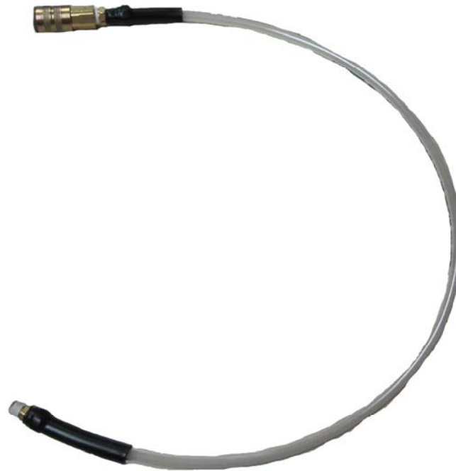
Part# 6116 Clear Hose Assembled – 3 FT