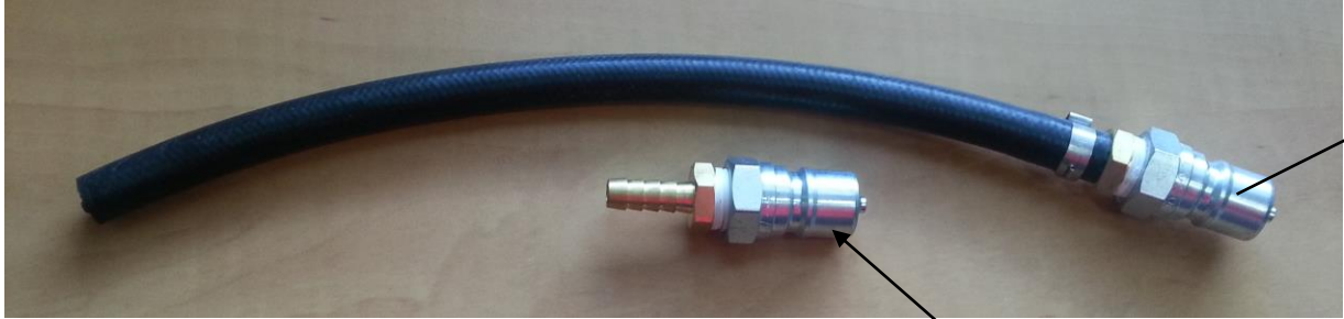
Part #7106 3/8"