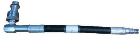
Part# 7119 Ford Escape Transmission Adapter