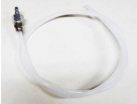
Part# 7094-1 Thermostat Bypass Through Dipstick for GM and Ford