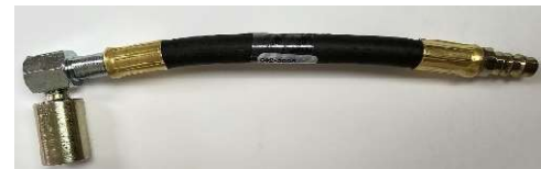
Part# 7119F 3/4" Ford Female 90 Elbow