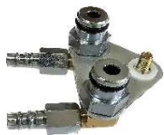
Part# 7133 Ford Double Male O-Ring - Ford & GM 8 Speed 2019 & Newer