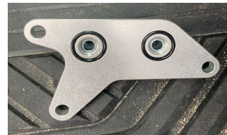
Part# 7099 Toyota Sequoia/Tundra Transmission Adapter